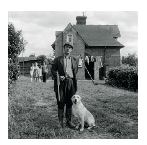
M AGES © DANIEL MEADOWS